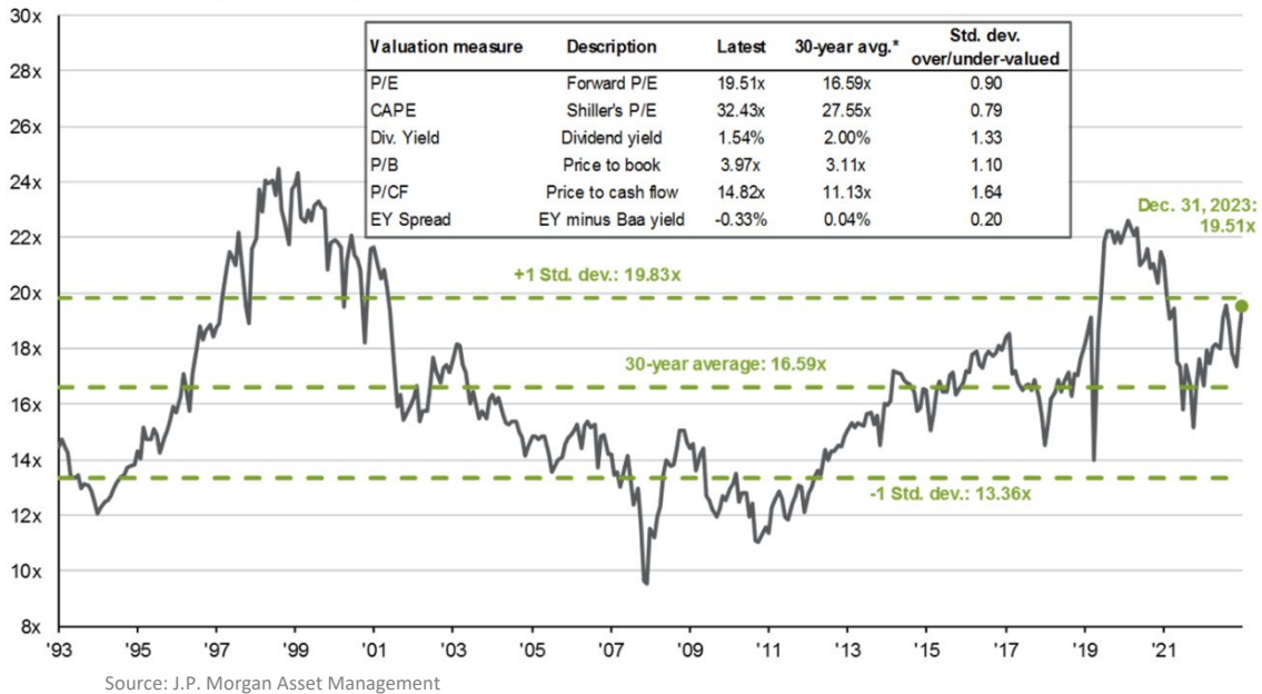
S&P 500 Index: Forward P/E ratio

That’s a wrap on the first month of the year and Growth is, once again, head of the pack. If this story sounds familiar, well, that’s because it is. January of 2023 saw domestic markets rally with the S&P up 6.2%, and the Russell 1000 Growth up 8.3%. Albeit more modest than last January, this year saw the S&P and Russell 1000 Growth close the month up 1.6% and 2.5%, respectively.